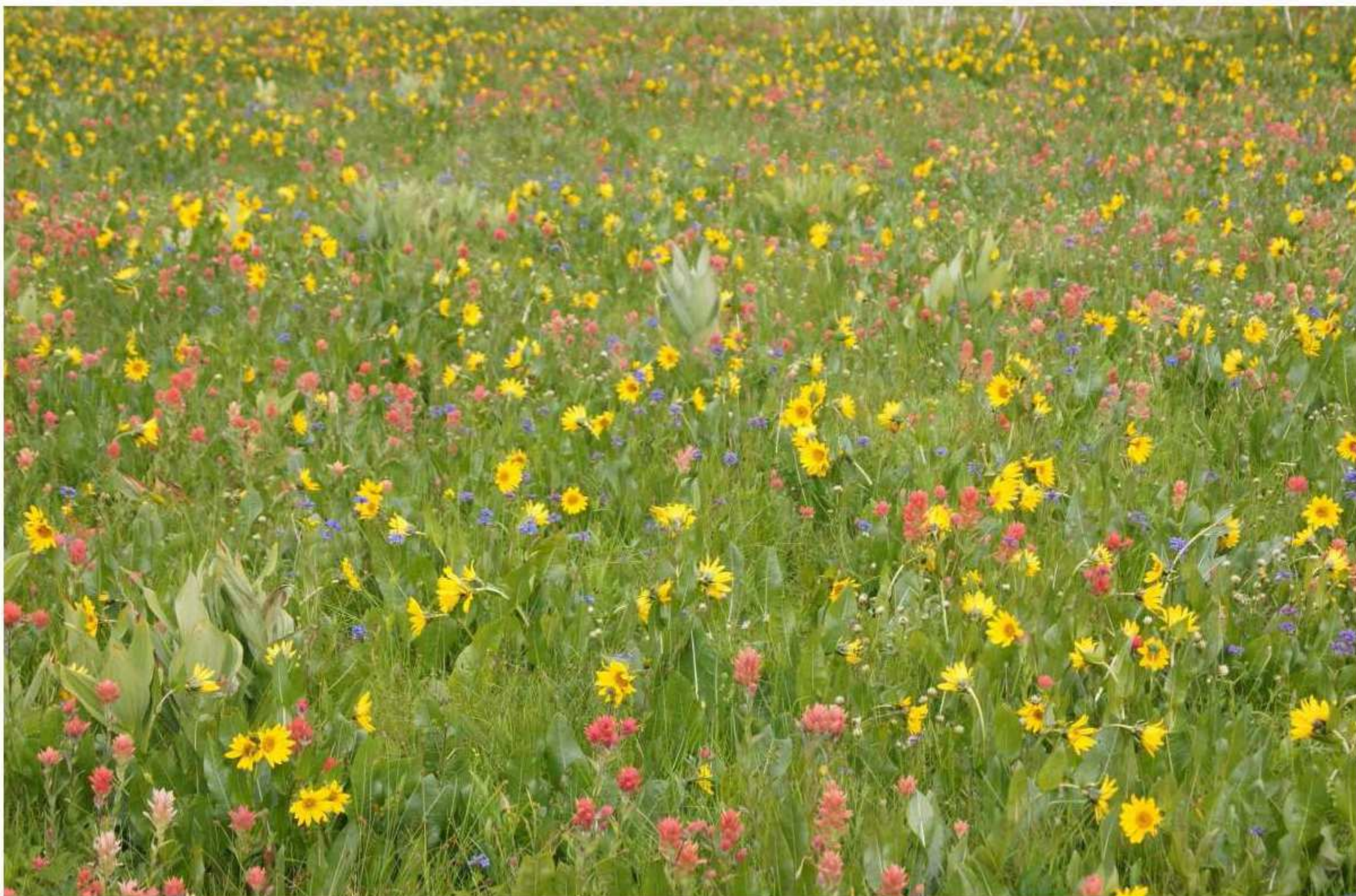
Figure 8. Lomatium knokei habitat at the type locality.